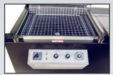
Dual Magnet Hold Down During Seal Cycle.

Now Available in 110 or 220 Volt For Higher Performance and Lower Operating Costs